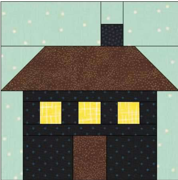
HOME SAFE HOME 4" X 4" & 8" X 8" FIBRECHICK